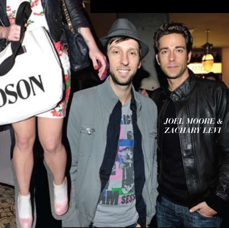
JOEL MOORE & ZACHARY LEVI