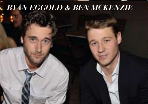
RYAN EGGOLD & BEN MCKENZIE